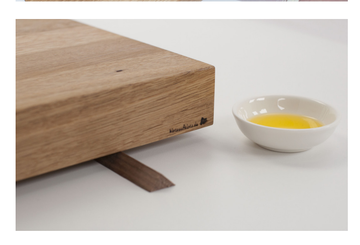
For safety reasons : Beware the self-ignitability of the oily rags and only bin them once completely dried.